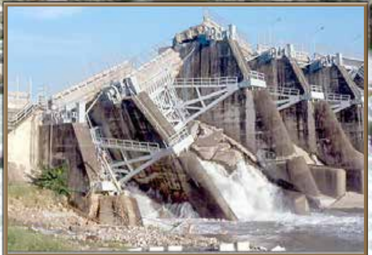
A barrage collapses due to natural disaster: a growing risk in the light of climate change